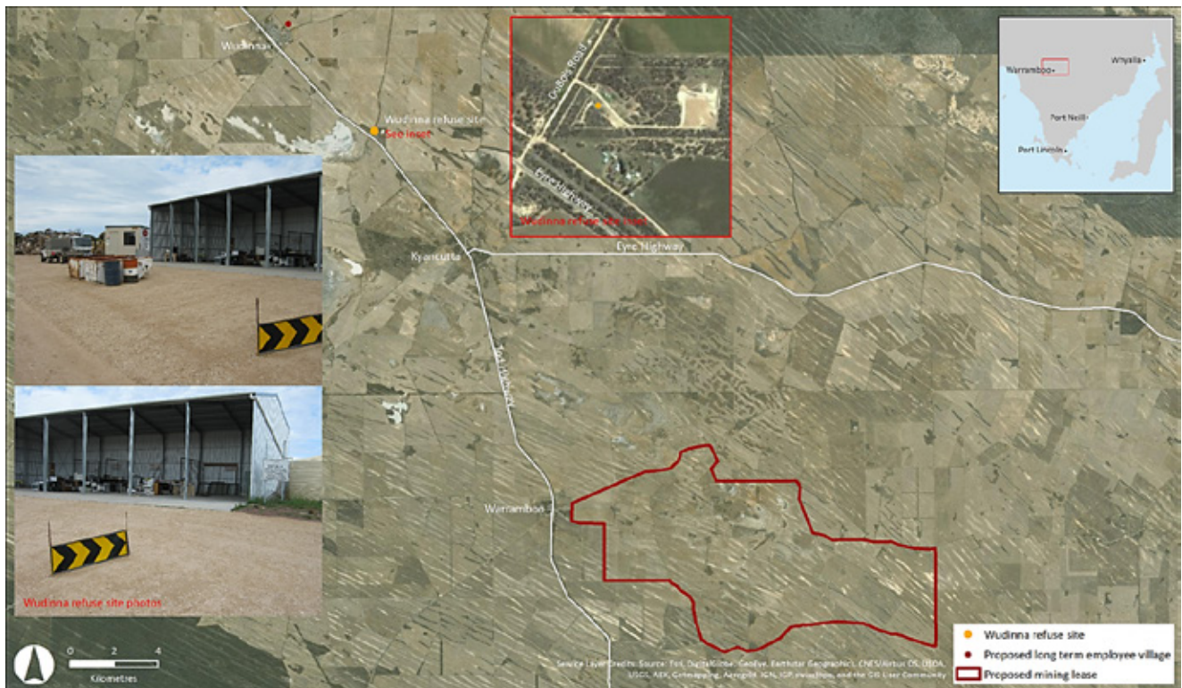
Plate 14-1 Wudinna Landfill

The proposed mine site will result in the generation of significant waste streams that (if utilised) would affect the lifespan of the Wudinna landfill and is discussed in Section 14.7.