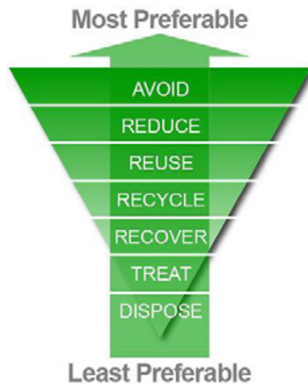
Figure 14-1 Waste Management Hierarchy (Zero Waste SA 2004)