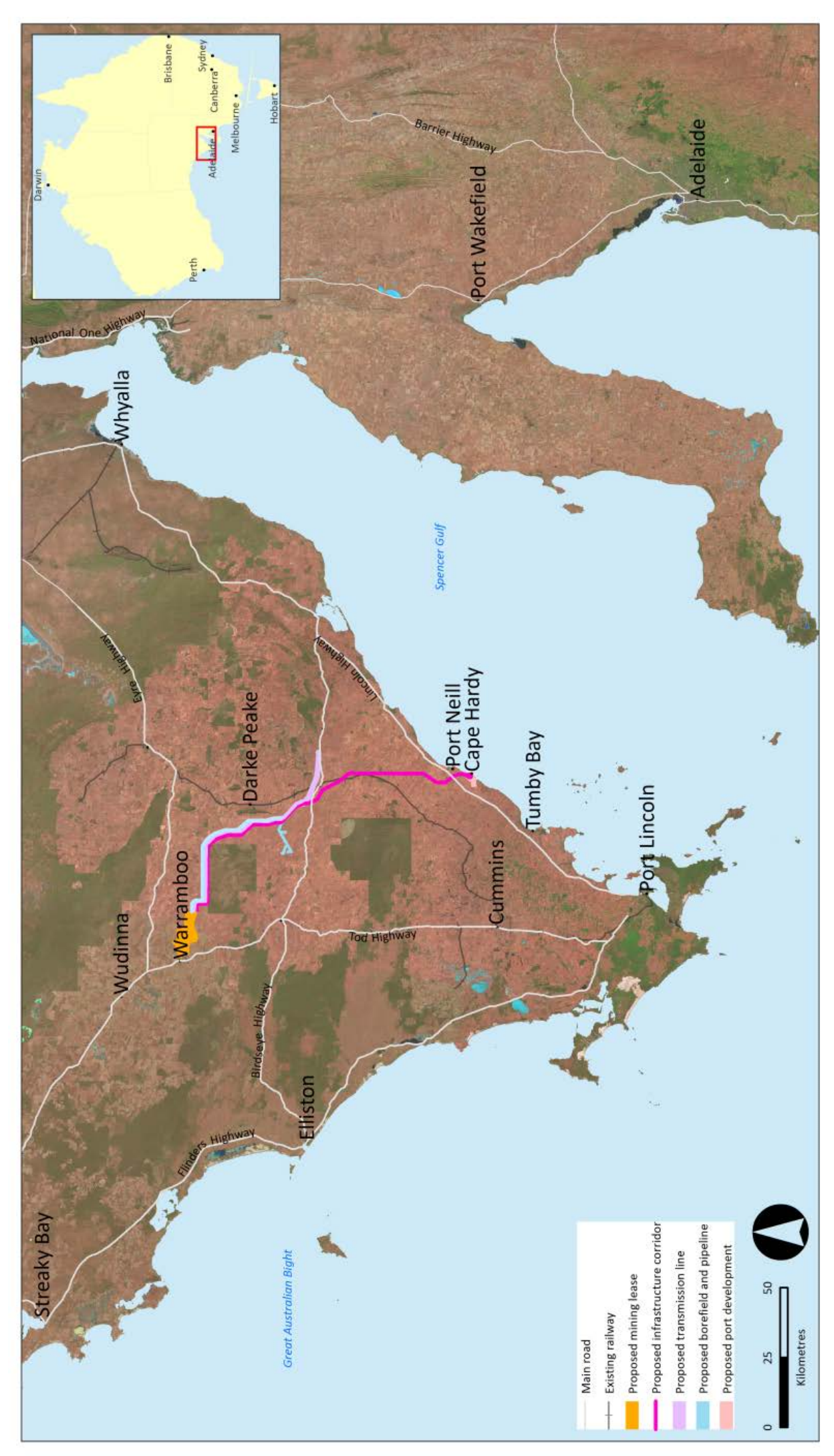
Figure 1-1 CEIP Location