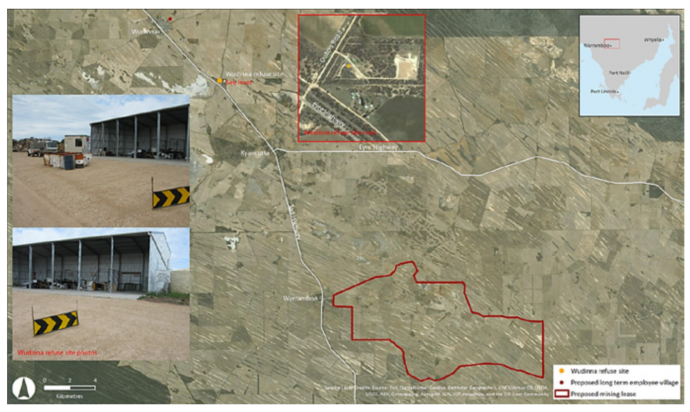
Plate 14-1 Wudinna Landfill

The proposed mine site will result in the generation of significant waste streams that (if utilised) would affect the lifespan of the Wudinna landfill and is discussed in Section 14.7.