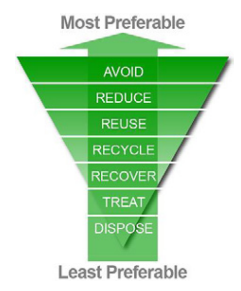
Figure 14-1 Waste Management Hierarchy (Zero Waste SA 2004)